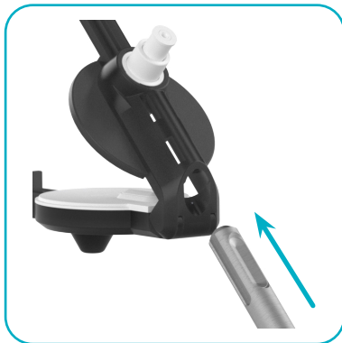
Guided insertion and simple securing