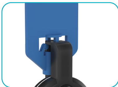
The label is secured without obstruction